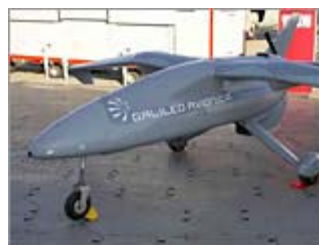
Photos of Unmanned Aerial Vehicles (UAV)

For additional information on this conference, please see the following website: http://www.examiner.com/p-164612~Texas_Border_Coalition_Members_to_Meet_During_Global_Border_Security_Conference_on_Border_Alternatives_at_Technology_Expo.html